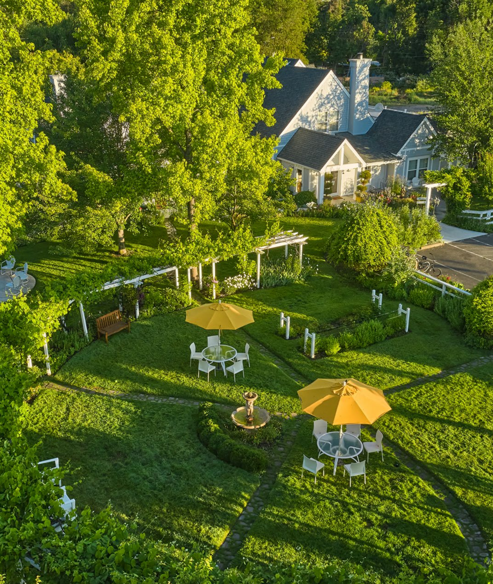
Lithia Springs Resort & Wine Garden / 2165 W. Jackson Rd., Ashland, Oregon / 541.482.7128 541.631.2006 / lithiaspringsresort.com/weddings