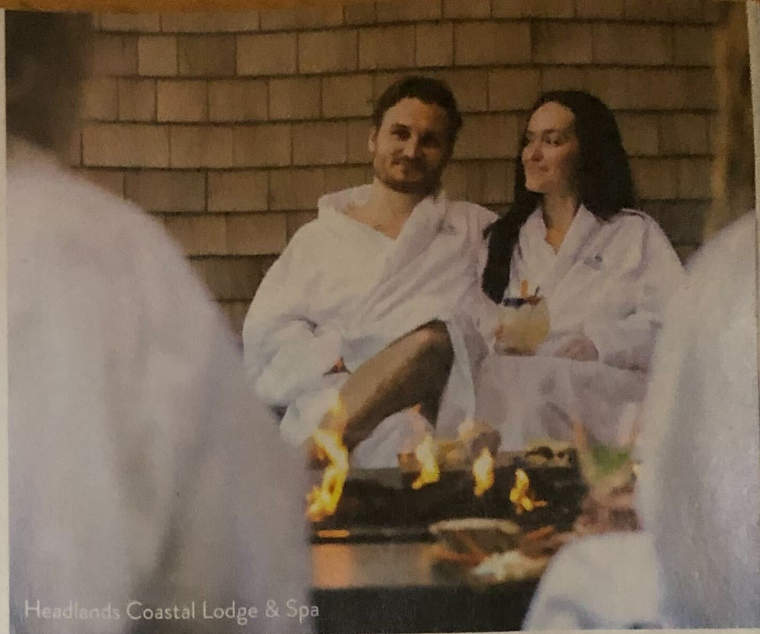
Headlands Coastal Lodge & Spa

Silvies Valley Ranch | Burns, Oregon silvies.us