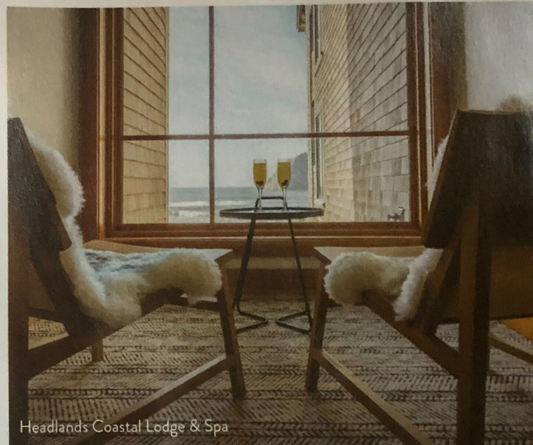
Headlands Coastal Lodge & Spa