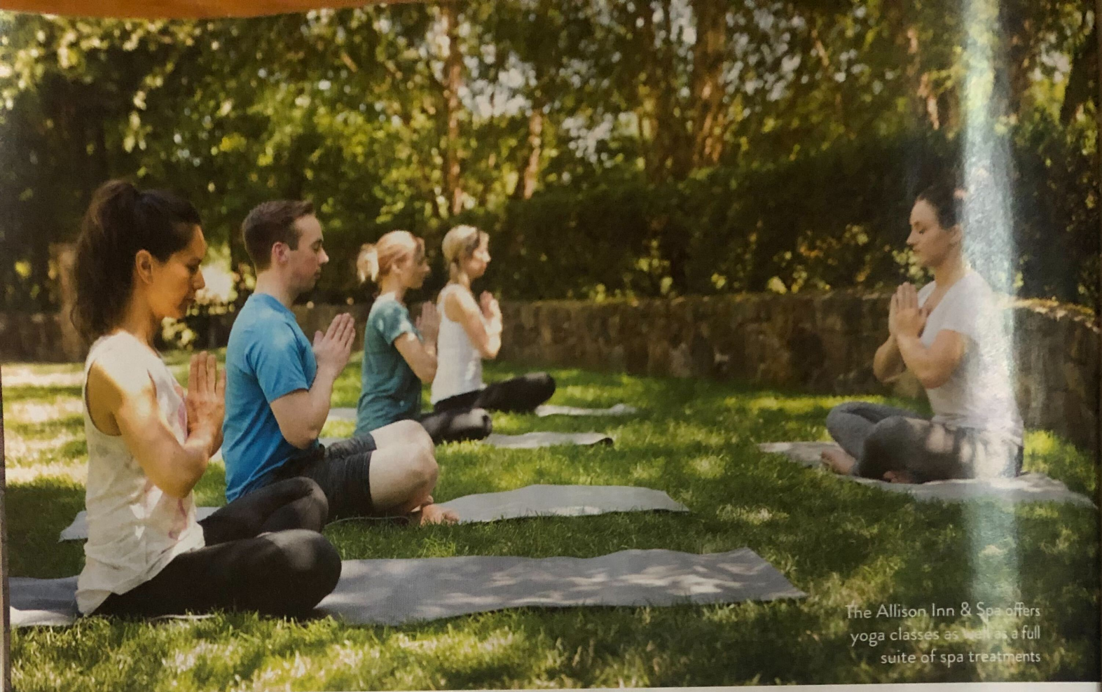
The Allison Inn & Spa offers yoga classes as well as a full suite of spa treatments

For dinner, we drove the short distance into Ashland, a town that grew up around the world-renowned Oregon Shakespeare Festival. Here, old English style balances contemporary shopping and dining, along with access to nature by way of the lush, labyrinthine 93 acres of Lithia Park. Dinner at the Brickroom on the creek included wild-caught sockeye salmon and ginger coconut soup, after which we returned to the resort for our first—but not last—soak in the mineral waters.